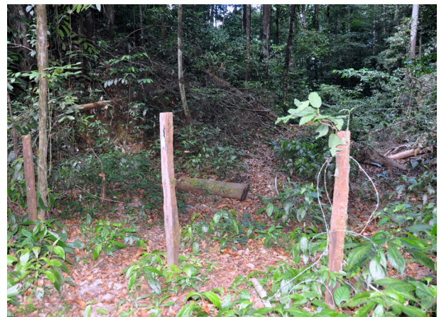
Fig. 4. Habitat where Ptychoglossus brevifrontalis was collected at the BNP.

One juvenile female of P. brevifrontalis , voucher number NZCS R679, was collected on 01 November 2014. The location where the specimen was collected was covered with dried fallen leaves and consisted of